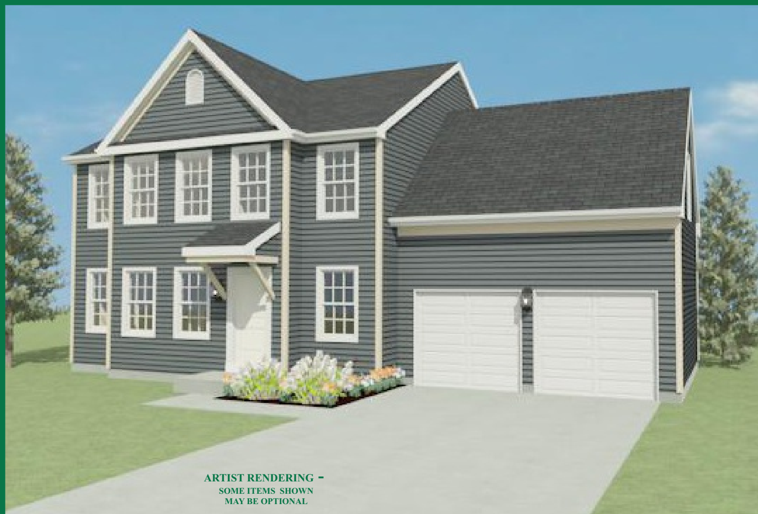
ARTIST RENDERING - SOME ITEMS SHOWN MAY BE OPTIONAL