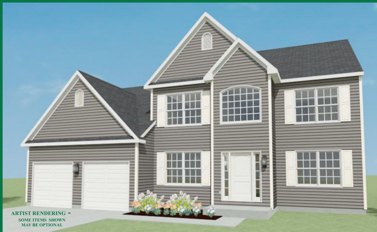
ARTIST RENDERING - SOME ITEMS SHOWN MAY BE OPTIONAL